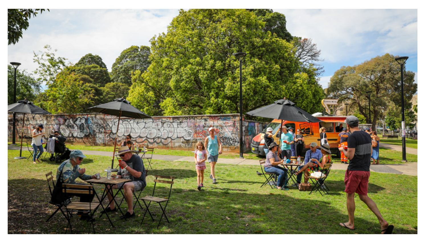
Community BBQ.