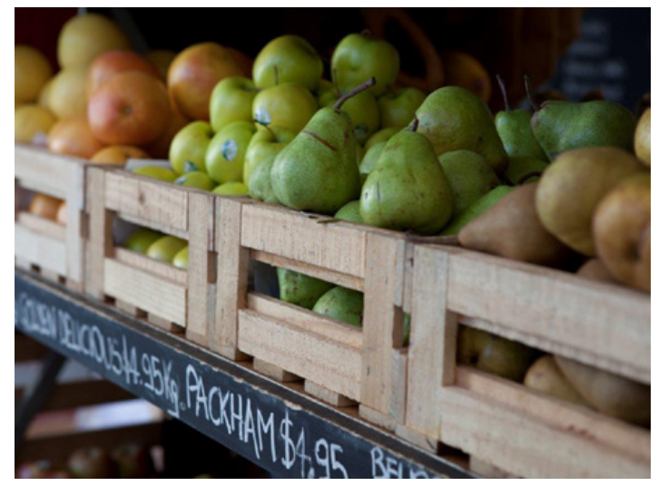
Healthy Food Options.