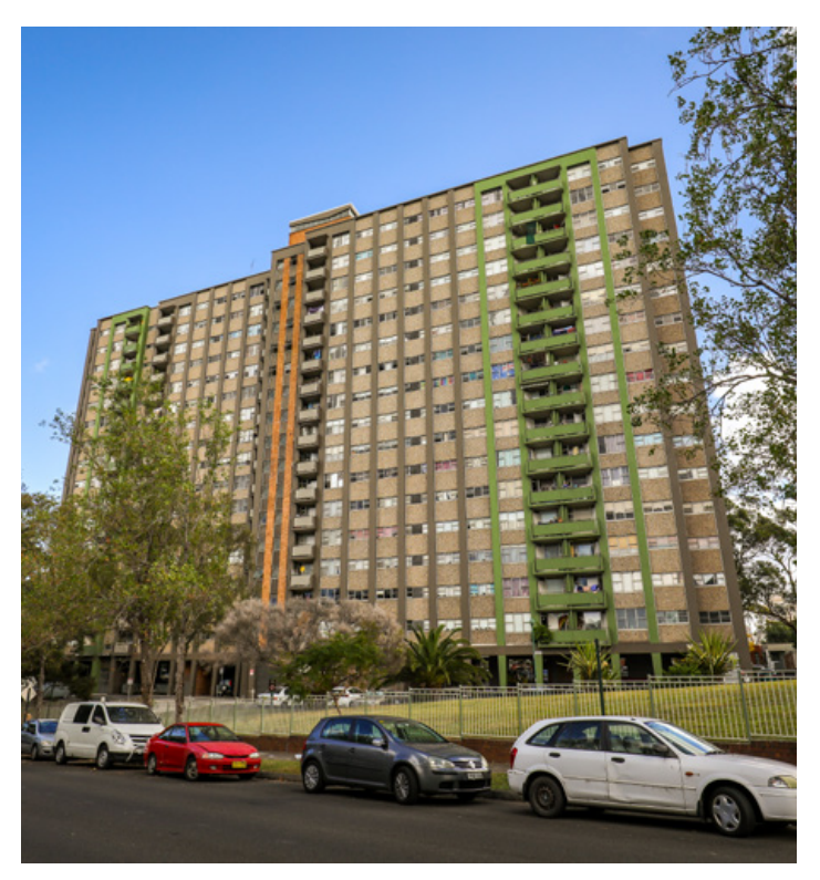
Redfern.

There are nearly 9,700 social housing tenancies in the City of Sydney local area. The major social housing estates are in Redfern, Waterloo, Surry Hills, Woolloomooloo and Glebe.