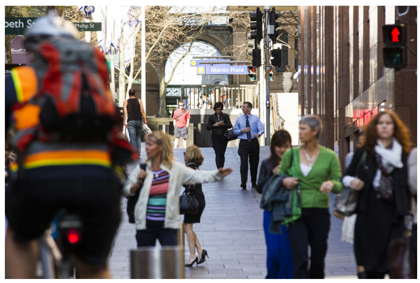
Martin Place.