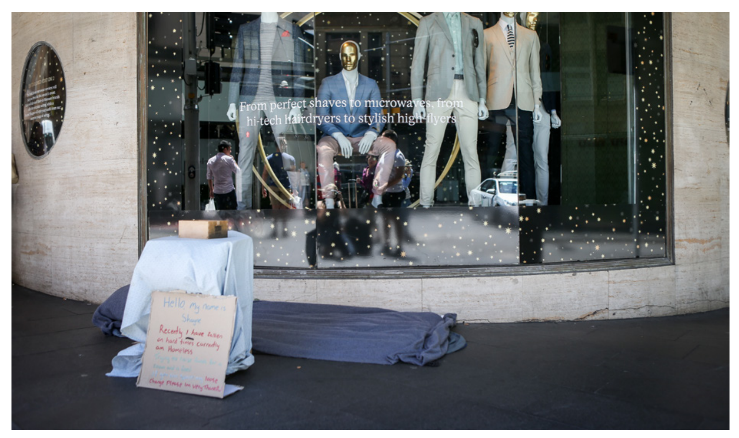
Sydney CBD.

Email : homelessness@cityofsydney.nsw.gov.au Website : cityofsydney.nsw.gov.au/community/ community-support/homelessness