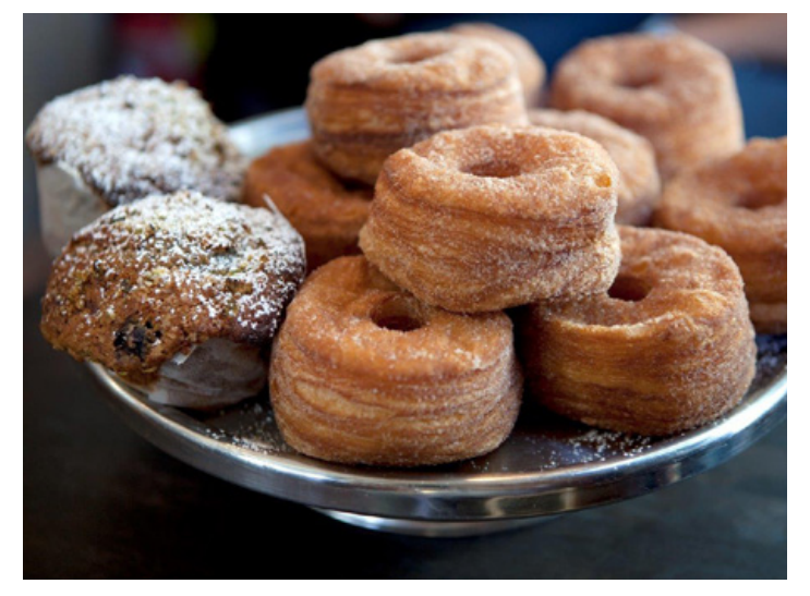
Innutritious Food.

In addition to providing nutritious food, mobile voluntary services should provide a range of food options that are appropriate to the varying health needs of service users. For example, poor dental health and hygiene is prevalent among vulnerable populations. It is therefore important to offer food that someone with poor dental health and hygiene can eat.