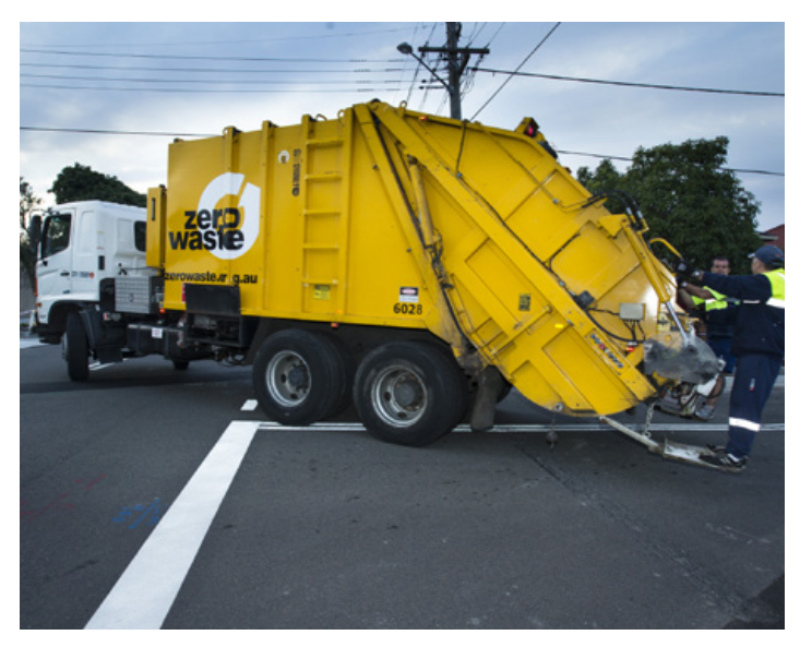
City Cleansing and Waste.