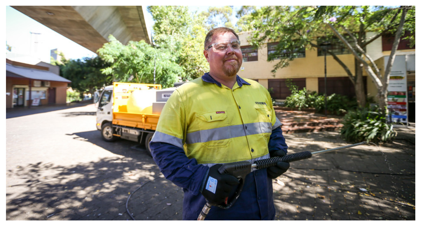
City Cleansing and Waste.

Under the Protection of the Environment Act 1997 , the City has the authority to issue penalties for littering or dumping.