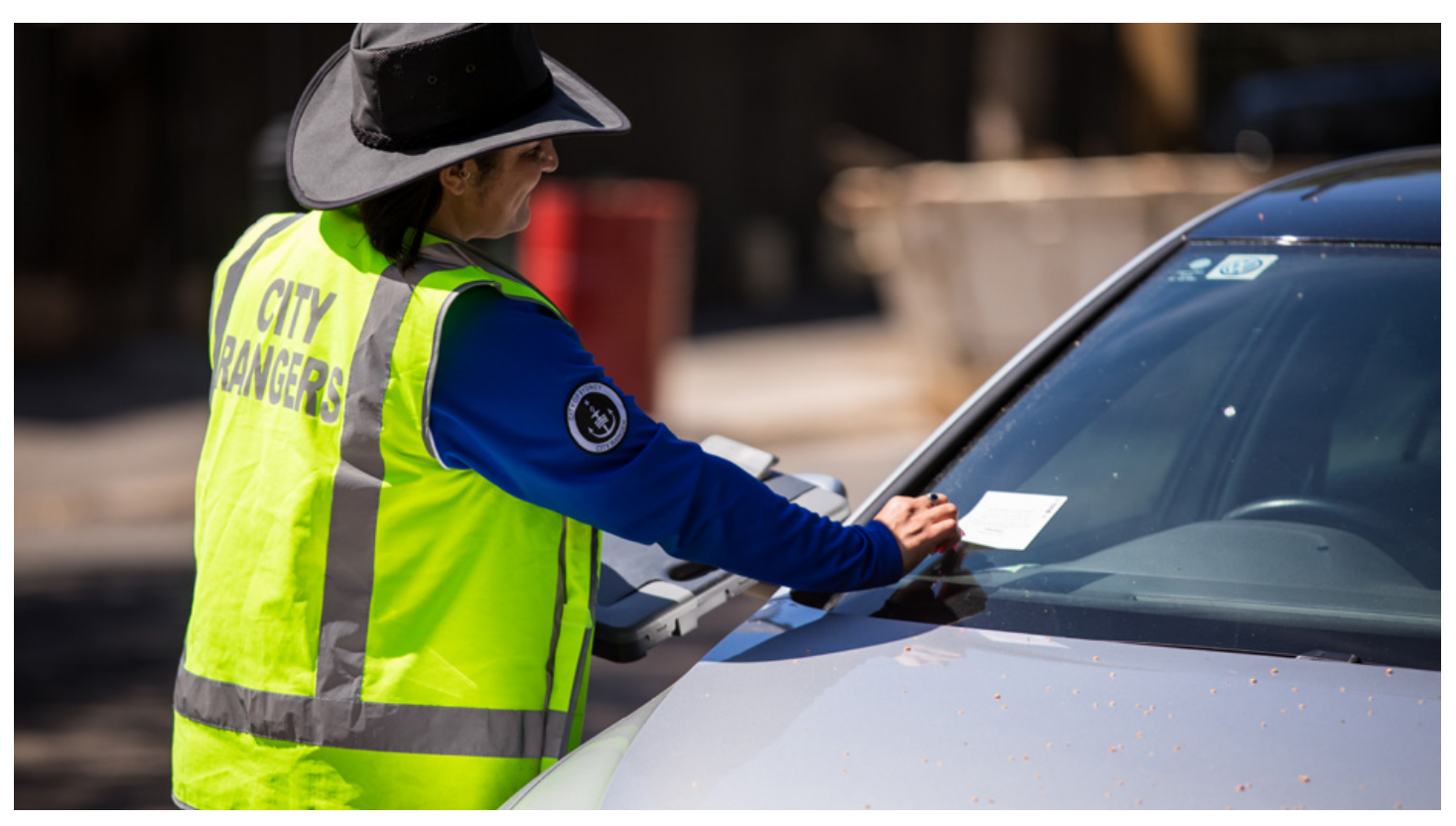
City Rangers.