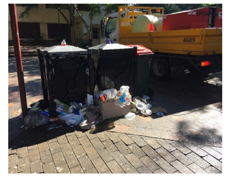
City Cleansing and Waste.